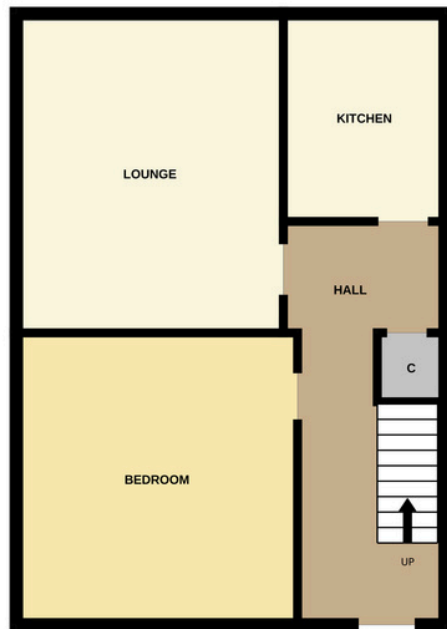
SECOND FLOOR 46.7 sq.m. approx.