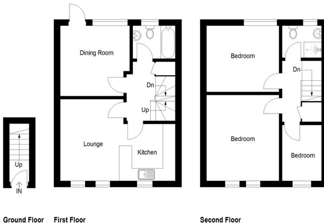
Illustration For Identification Purposes Only. Not To Scale (ID: 1191183 / Ref: 90387)