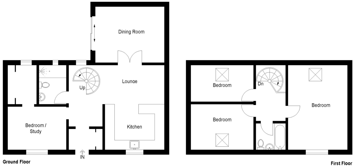
Illustration For Identification Purposes Only. Not To Scale (ID:906619 / Ref:82947)

Approximate Gross Internal Area = 119.5 sq m / 1286 sq ft